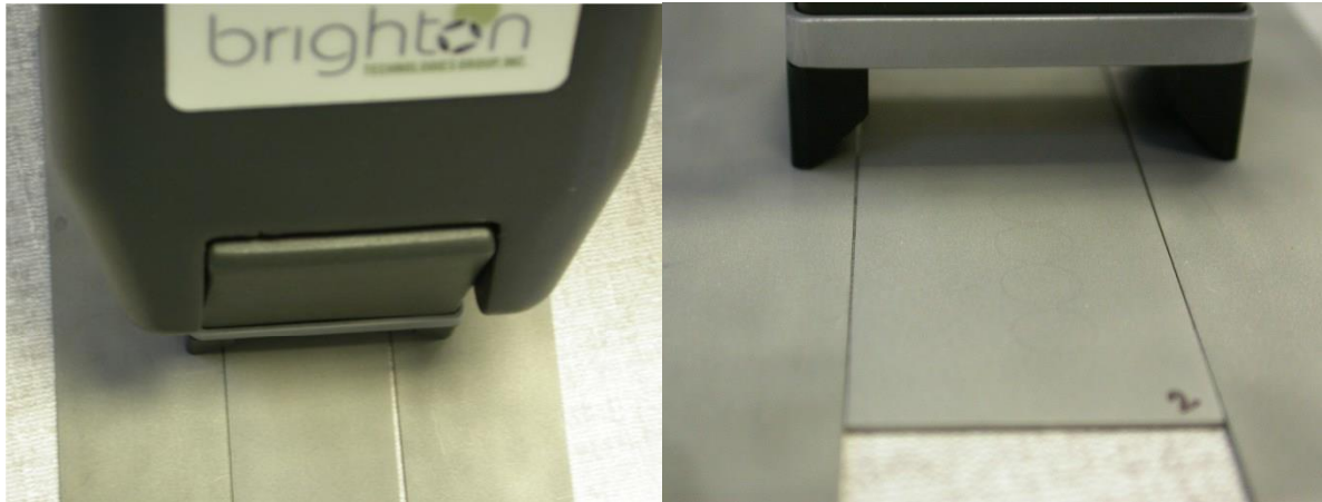
Figure 3. Images illustrating how two additional coupons were used to control the spacing between the Surface Analyst and the coupon to be measured.

extra coupons alongside the coupon of interest allowed multiple measurements to be made on untouched portions of the coupon being evaluated.